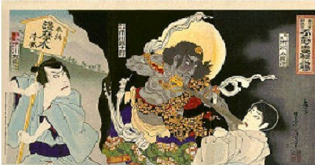
This is a picture of Fudo Myo 'o from a Japanese movie. Notice that Fudo Myo 'O is portrayed as a Black deity

Fudo "The Immovable" is one of Brightness, who protects Buddhist truth. With the Sword of Wisdom he slashes deluded thought. and with his rope he ties demons and lassos floundering appearances, Fudo is essentially benevolent and committed to the salvation of all beings.