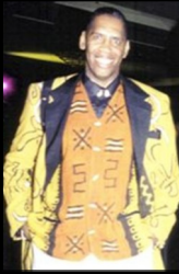
Amp was a 5 time World Kickboxing Champion.