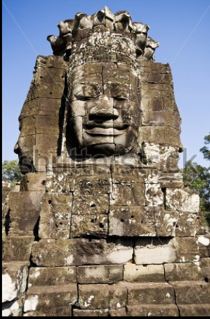
Angkor wat Cambodia

Nichiren the Messenger of the Buddha 1st Chanted Nam (u ) Myoho Renge Kyo on April 28, 1253. Saint Nichiren started a Buddhism that was inclusive of all humanity that included the Black Gods. Nichiren even identified with those of African decent by stating that he was of the Chandala family. The Chandalas were the Black people of India who suffered the worst inhumanity against humans in all history. When Nichiren