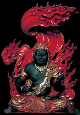
Dai Bishamon Tenno

When you study Buddhism you will find Black history on the Gohonzon. Buddhism was a Black religion. Nichiren included the Black Gods Fudo Myo'O and Dai Bishamon Tenno on the Gohonzon. Shakyamuni, Daibadatta, the Naga Girl, the dragon King were Black people. Nichiren identified with the Black people in India called the Chandalas. We teach accurate culture and history in our Buddhist practice.