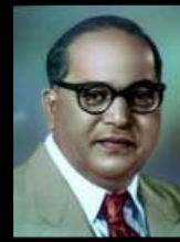
Dr. Bhimrao Ambedkar

A Buddha is known by his or her behavior as a human being. Those who fight for equality, justice and liberation are true Bodhisattvas.