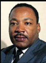
Martin Luther King

We offer special prayers to the Black Bodhisattva who gave their lives fighting for equality all mankind. We remember Dr. Martin Luther King Jr. who fought for equality of all men. We remember Nelson Mandela who brought peace to the land of South Africa. We remember Malcolm X who gave us Pride. We remember Dr. Bhimrao Ramji Ambedkar who freed our brothers in India. He brought Millions back to Buddhism in India. You will know a true Bodhisattvas by how they act as humans in our world.